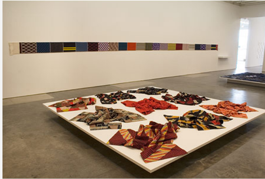
Installation view of Asiatica Vintage Japanese textiles.