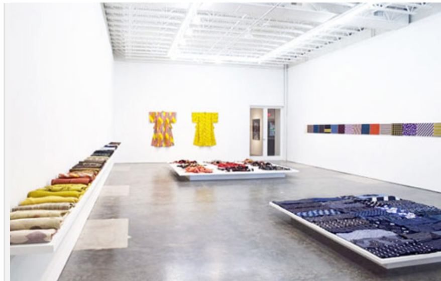
Installation view of Asiatica Vintage Japanese textiles.

The Dolphin Gallery's clean, airy space allows the entire "sample" to be displayed in one unending rainbow, boggling the mind with the similarity that contemporary design has in connection with ancient pattern, technique and color.