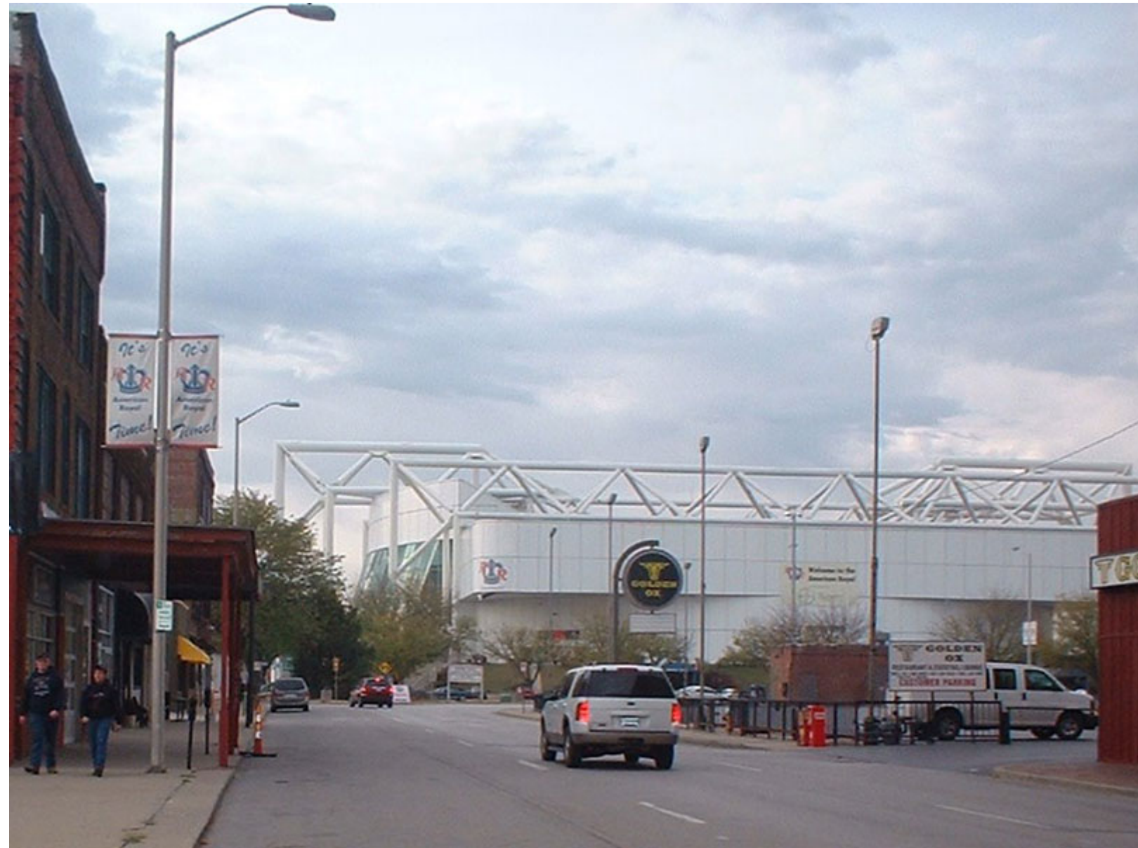
Genessee Street, looking south to Kemper Arena.