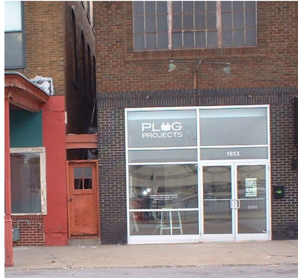
PLUG Projects, 1613 Genessee Street.

arts community produces and shows homegrown and migrating talent.