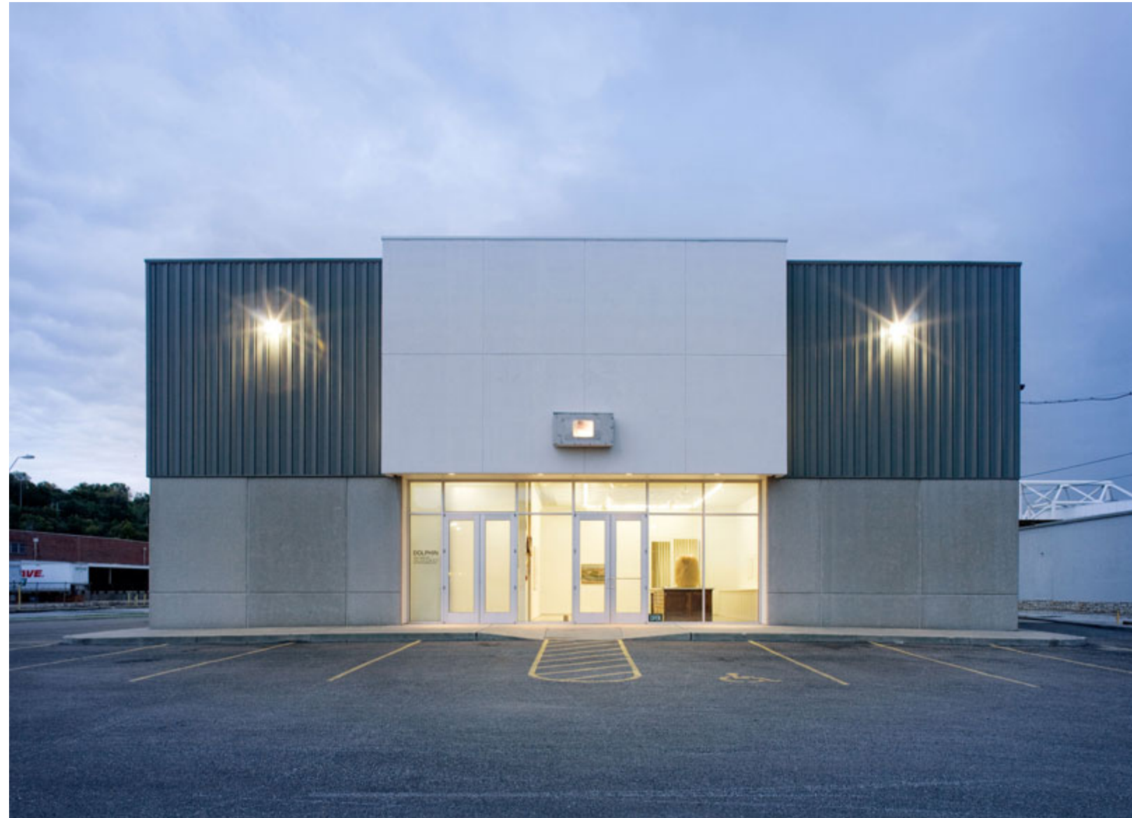
Dolphin Gallery, 1600 Liberty, two blocks east of Genessee Street.