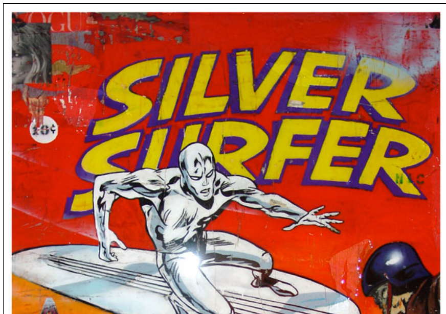
Greg Miller, Silver Surfer in Disguise , 2005, mixed media on wood panel