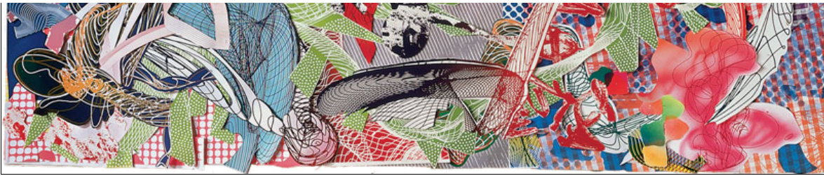
Frank Stella, Ohono , 1994_ ink and paper collage.