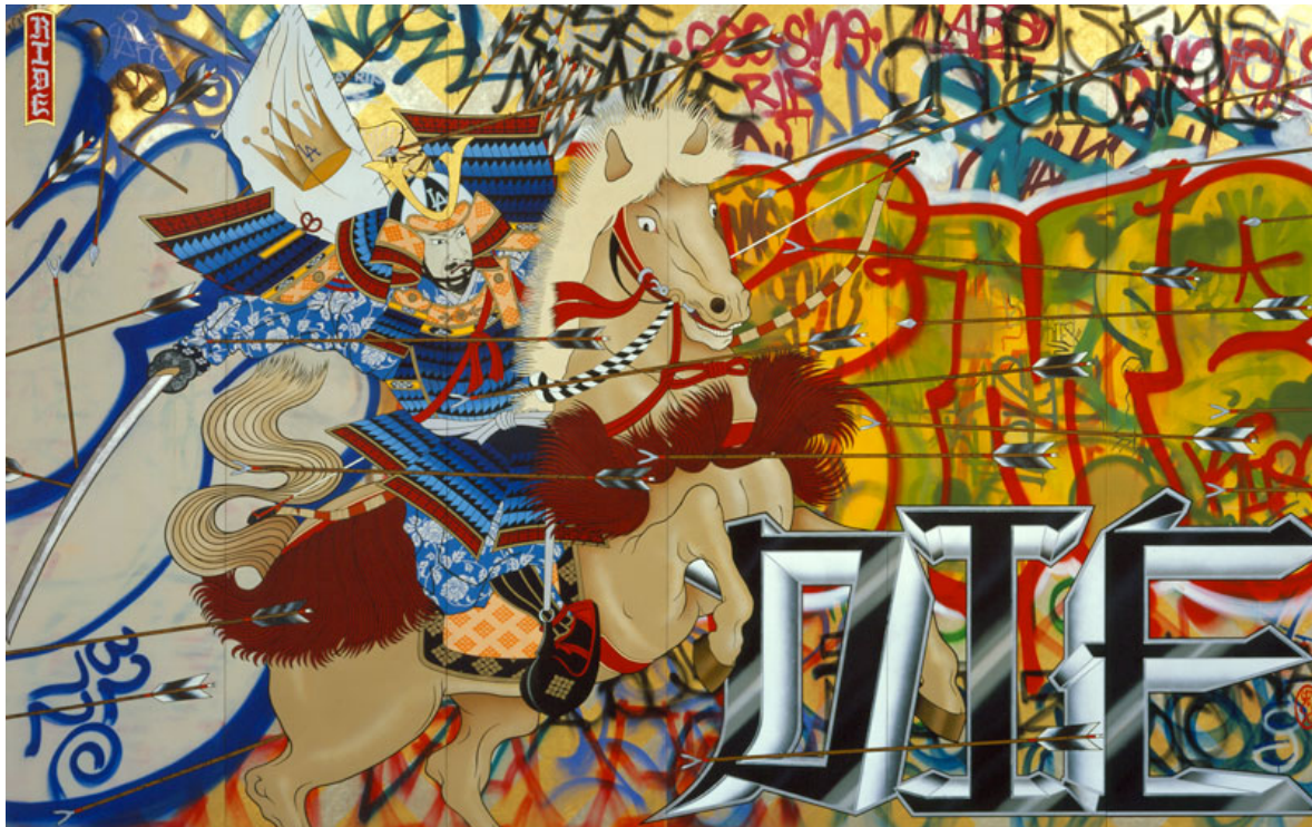
Gajin Fujita, Ride or Die , 2005, spray paint, paint marker, paint stick, gold and white gold leaf.