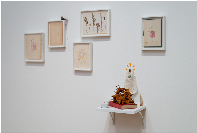
Installation view, 'Rodolfo Marron III: A Poke Ghost and the Garden of Tearz' at the Nerman Museum of Contemporary Art (click to enlarge)

The materials here include pressed flowers ("Flowers for the Ones I Love") as well as drawings of floral patterns made from bilberries, hibiscus, and butterfly ink, all done on paper taken from books found at the thrift store. Their small, similar size gives the drawings the appearance of intimate recollections from a diary. You can see that great care has been taken to ensure that lines and other markings are given the right amount of precision and fragility. Their gentleness is almost too precious.