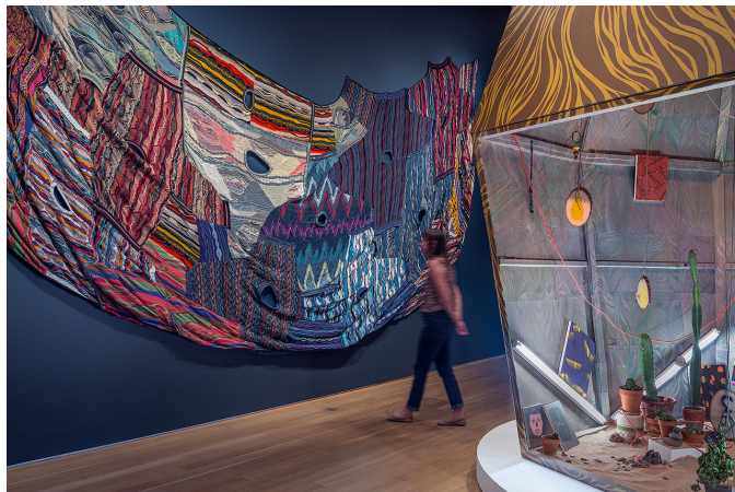
Installation view, 'Amir H. Fallah: The Caretaker' at the Nerman Museum of Contemporary Art (click to enlarge)

These canvases depict amorphous shapes which appear to the eye as patterned shrouds, raising the question of whether they're human or sculptural figures. Except for the different colors and patterns, the shapes are indistinguishable from one another, like a group of ghostly apparitions. They evoke the human need to veil or costume ourselves with objects and materials, wearing adornments so that we are perceived as we wish to be instead of presenting ourselves as we really are.