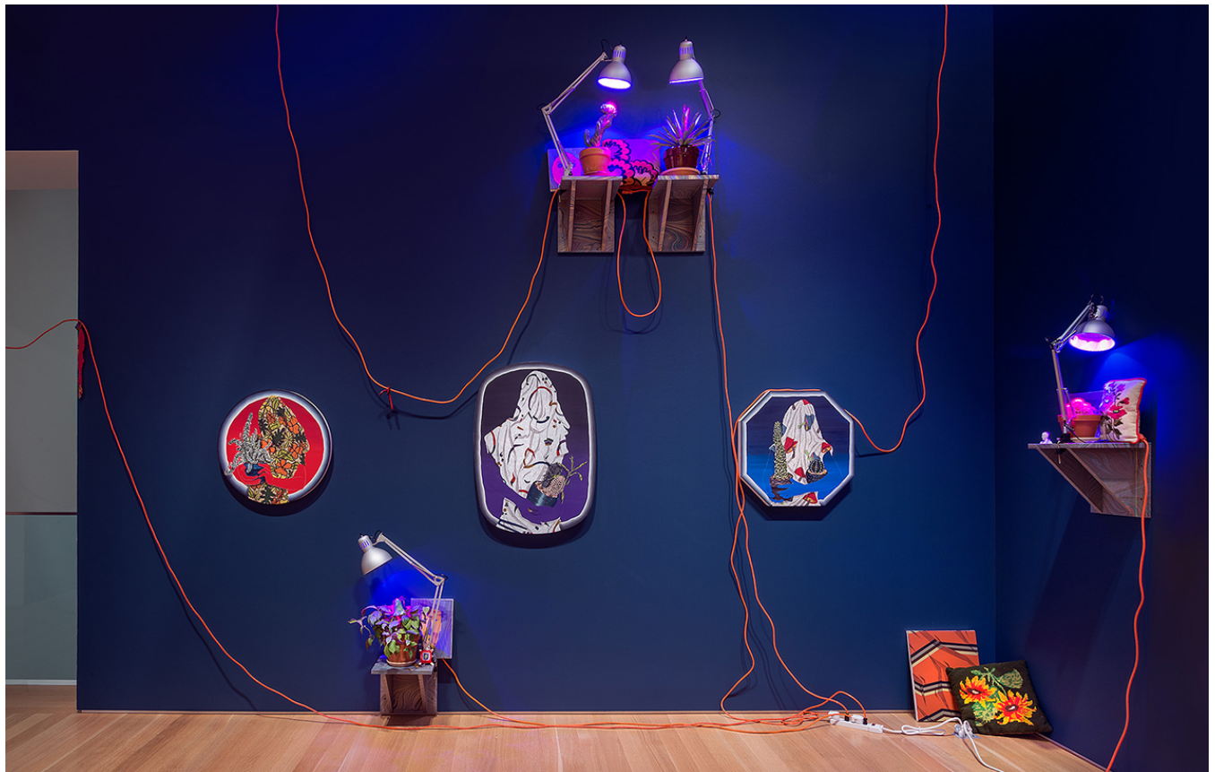
Installation view, 'Amir H. Fallah: The Caretaker' at the Nerman Museum of Contemporary Art

These canvases depict amorphous shapes which appear to the eye as patterned shrouds, raising the question of whether they're human or sculptural figures. Except for the different colors and patterns, the shapes are indistinguishable from one another, like a group of ghostly apparitions. They evoke the human need to veil or costume ourselves with objects and materials, wearing adornments so that we are perceived as we wish to be instead of presenting ourselves as we really are.